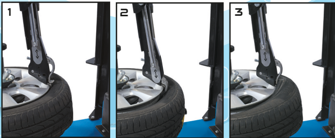
Evolution Device to convert standard machine into leverless operation